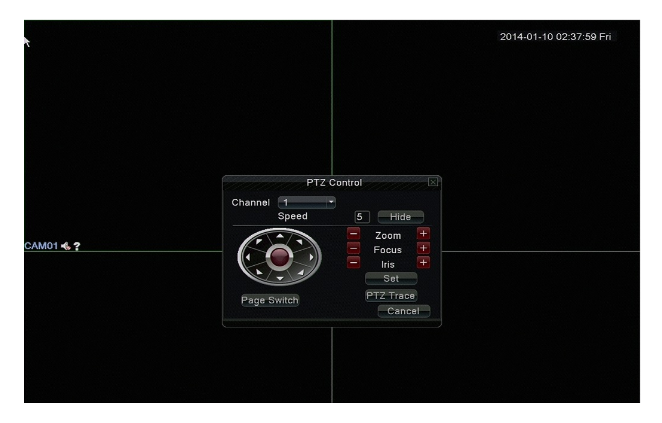
Step 2: Once you have the desitred position, click Cruise buttons, the write proper value into the Cruise Line and Preset Points blank then click "SET" which will open the PTZ Config menu.

Step1: In picture below, the directional control will turn the PTZ camera to the designated location.